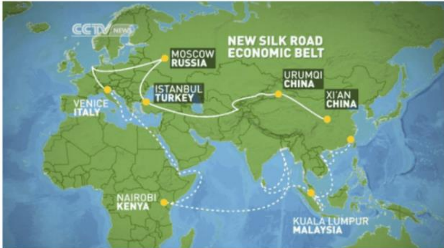
The CCTV News map showing the New Silk Road Economic Belt